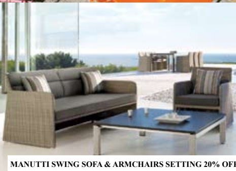
MANUTTI SWING SOFA & ARMCHAIRS SETTING 20% OFF (floor stock only)