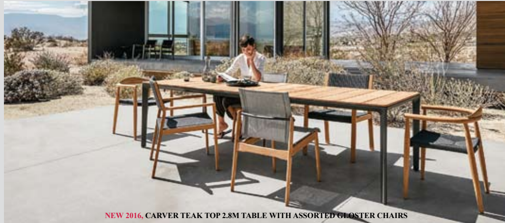
NEW 2016, CARVER TEAK TOP 2.8M TABLE WITH ASSORTED GLOSTER CHAIRS

This chic table design has legs that appear to have been sculpted from a solid block, similar to the way an artist can carve a picture into a piece of wood and create a unique piece. The table tops are available in a pumice coloured ceramic or beautiful teak slats with a buffed finish. The powder coat Aluminium frames are available in white or meteor (pictured). Carver tables come in 3 sizes 170cm, 220cm and 280cm all by 99cm wide. Gloster make a wide selection of dining chairs which are coordinated with the same colour ways to complement the tables