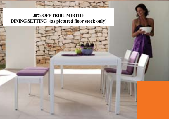
30% OFF TRIBU MIRTHE DINING SETTING (as pictured floor stock only)