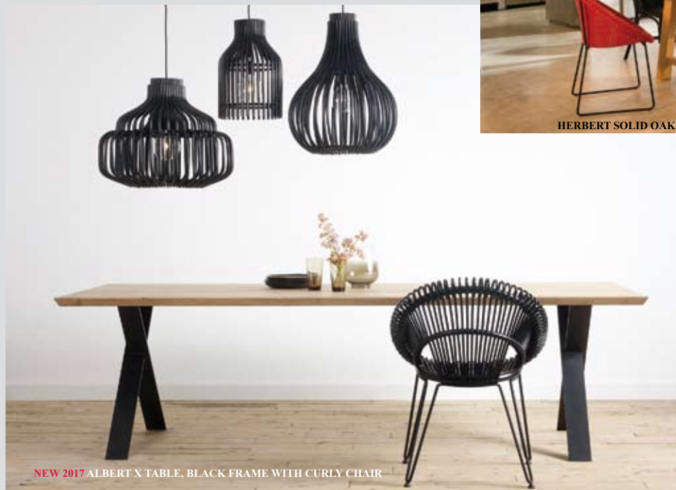
NEW 2017 ALBERT X TABLE, BLACK FRAME WITH CURLY CHAIR