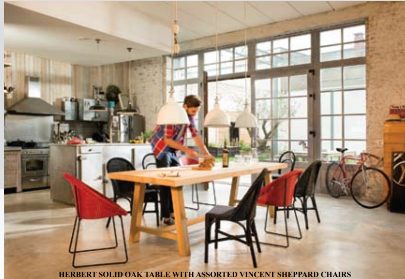
HERBERT SOLID OAK TABLE WITH ASSORTED VINCENT SHEPPARD CHAIRS

Vincent sheppard produce a wide variety of complimentary chairs with matching Oak or Metal legs to coordinate with their tables. See them on display at The Flower Garden from mid January.