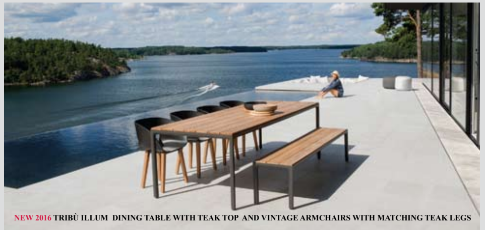
NEW 2016 TRIBÙ ILLUM DINING TABLE WITH TEAK TOP AND VINTAGE ARMCHAIRS WITH MATCHING TEAK LEGS