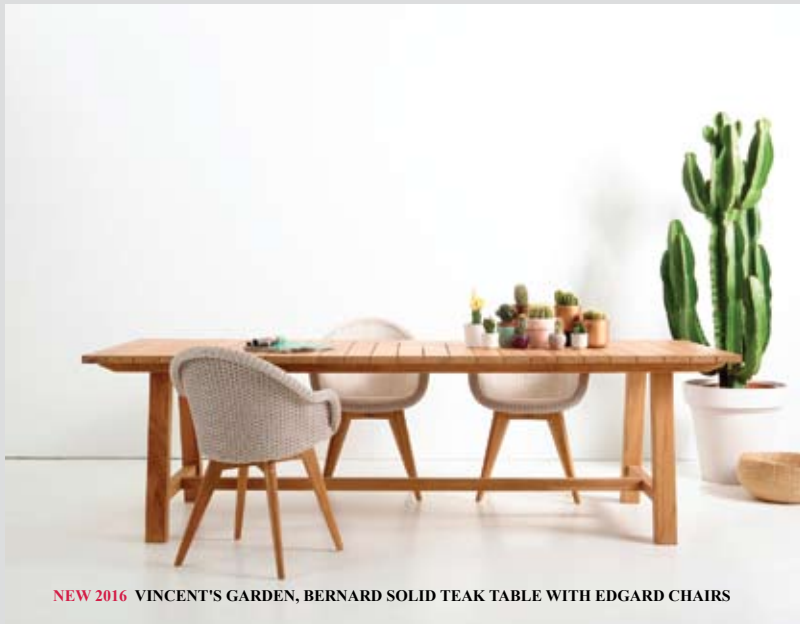
NEW 2016 VINCENT'S GARDEN, BERNARD SOLID TEAK TABLE WITH EDGARD CHAIRS

The stunning new Bernard tables from Vincent's Garden have a contemporary design. These tables are precisely crafted and constructed of solid, A grade, Indonesian plantation teak. No expense has been spared in the choice of the finest timber and construction methods, these tables are built to last a life time. The Bernard table is available in 3 sizes big enough to sit 8, 10 or up to 12 people with the large 3m size. They are available with a wide variety of chair designs to suit your needs