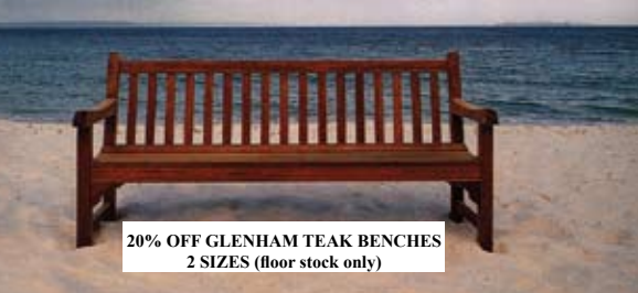
20% OFF GLENHAM TEAK BENCHES 2 SIZES (floor stock only)