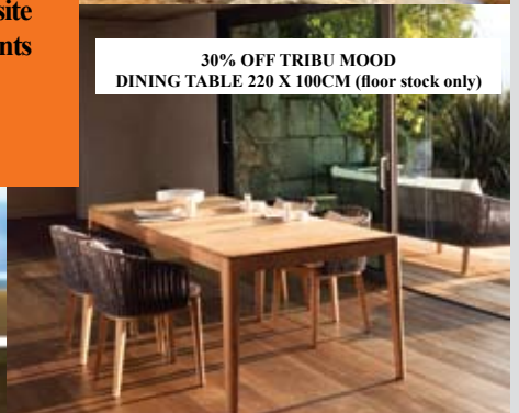
30% OFF TRIBU MOOD DINING TABLE 220 X 100CM (floor stock only)