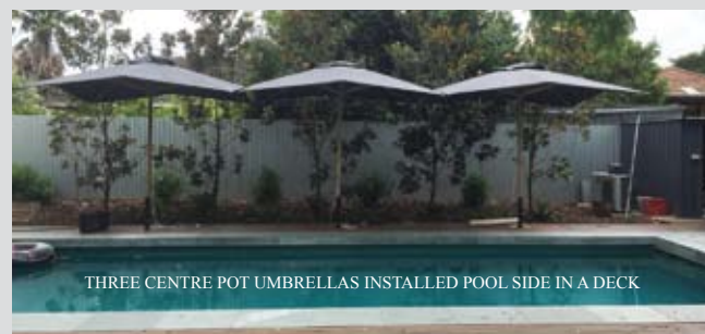
THREE CENTRE POT UMBRELLAS INSTALLED POOL SIDE IN A DECK