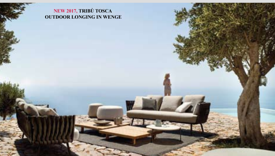
NEW 2017, TRIBÙ TOSCA OUTDOOR LONGING IN WENGE

The Tosca outdoor collection is warm and inviting, stylish and intriguing. Tribù for the first time called upon a female designer to create an outdoor furniture range with a more feminine touch. Monica Armani succeeded in her challenge : rounded forms, tapered legs and an elegant seating shell in powder coated stainless steel, upholstered with extra-wide braiding. The material for the braiding is genuinely innovative : foam mousse is encased in a seamless sheath of knitted textilene and polyolefine which makes the material weather-resistant, but also surprisingly soft to the touch. The seating comfort is especially pleasant, thanks to the comfortable outdoor cushions.