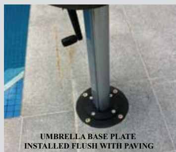
UMBRELLA BASE PLATE INSTALLED FLUSH WITH PAVING

We have installed many of our side post umbrellas over swimming pools and outdoor entertainment areas. Our installation above at Mandalay featured two of our new 3.5m Eclipse umbrellas installed parallel to each other with a detachable gutter between them ( not pictured ). This created a shaded area of 3.5m wide x 7m long and prevents water runoff during rain between the umbrellas. If you need shade for your family please call.