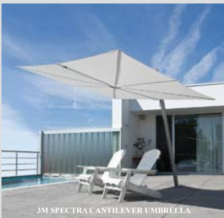
3M SPECTRA CANTILEVER UMBRELLA