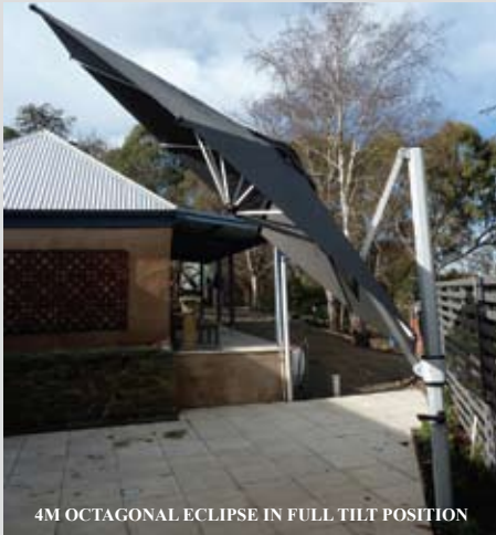
4M OCTAGONAL ECLIPSE IN FULL TILT POSITION