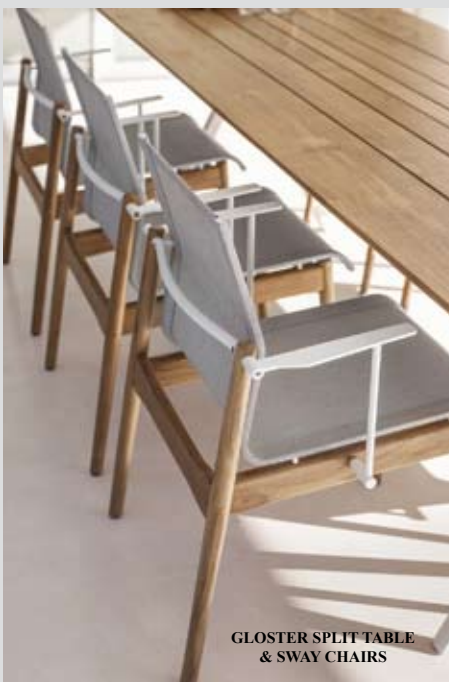
GLOSTER SPLIT TABLE & SWAY CHAIRS

Hope to see you soon at The Flower Garden.