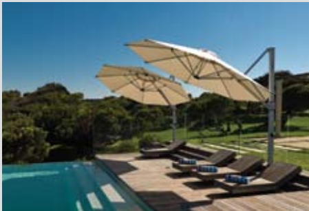
4M OCTAGONAL ECLIPSE IN HALF TILT POSITION

The ECLIPSE side post umbrella has been designed by a team of engineers from Australia. Their aim was to provide the best side post umbrella to the Australian market.