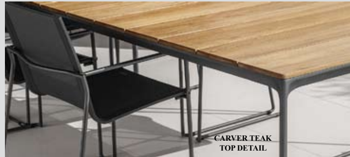
CARVER TEAK TOP DETAIL