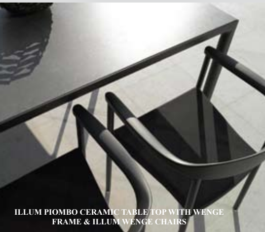
ILLUM PIOMBO CERAMIC TABLE TOP WITH WENGE FRAME & ILLUM WENGE CHAIRS