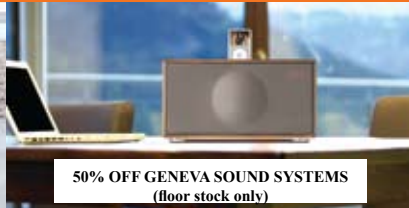
50% OFF GENEVA SOUND SYSTEMS (floor stock only)