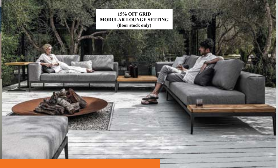
15% OFF GRID MODULAR LOUNGE SETTING (floor stock only)