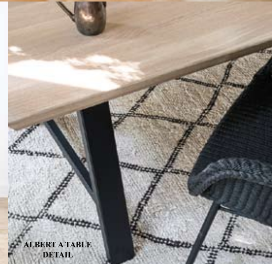
ALBERT A TABLE DETAIL