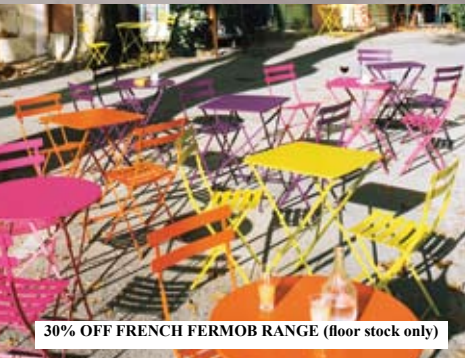
30% OFF FRENCH FERMOB RANGE (floor stock only)

SUMMER SALE 6TH - 15TH JANUARY. Beautiful Spring weather was almost nonexistent in 2016, because of this we are a little over stocked. We are offering substantial discounts on our quality outdoor furniture floor stock during our SALE and a 10% discount on furniture forward orders that are not in stock placed during our sale. Here is just a small selection of items that are heavily discounted in our sale. Much more to see in store We now also have a CLEARANCE page on our website for one off chairs and discontinued items, with discounts of up to 70% it is worth having a look at. This stock is limited so don't delay, please check opening times below.