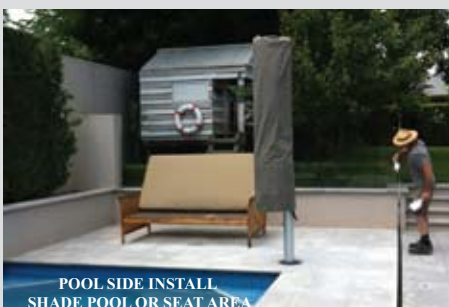
POOL SIDE INSTALL SHADE POOL OR SEAT AREA