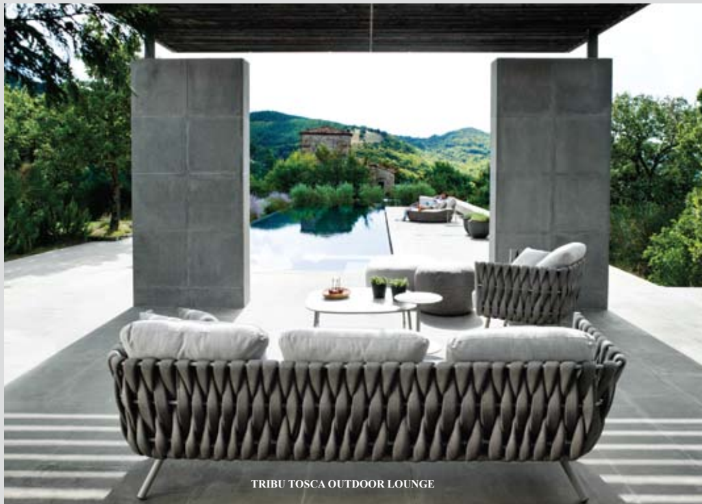
TRIBU TOSCA OUTDOOR LOUNGE