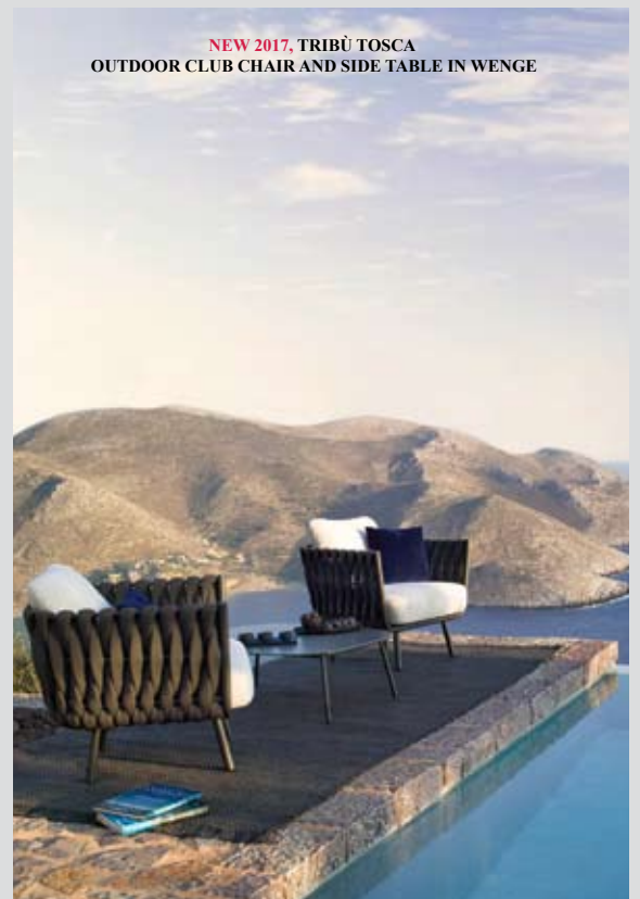
NEW 2017, TRIBÙ TOSCA OUTDOOR CLUB CHAIR AND SIDE TABLE IN WENGE