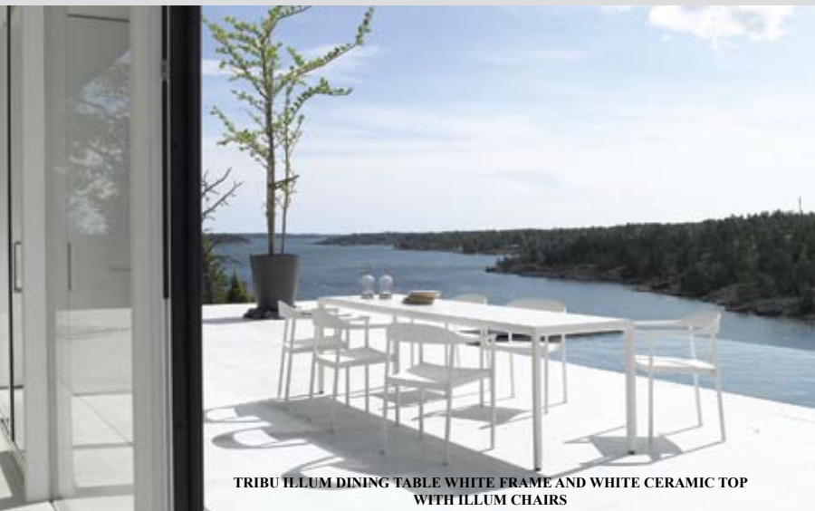
TRIBÙ ILLUM DINING TABLE WHITE FRAME AND WHITE CERAMIC TOP WITH ILLUM CHAIRS