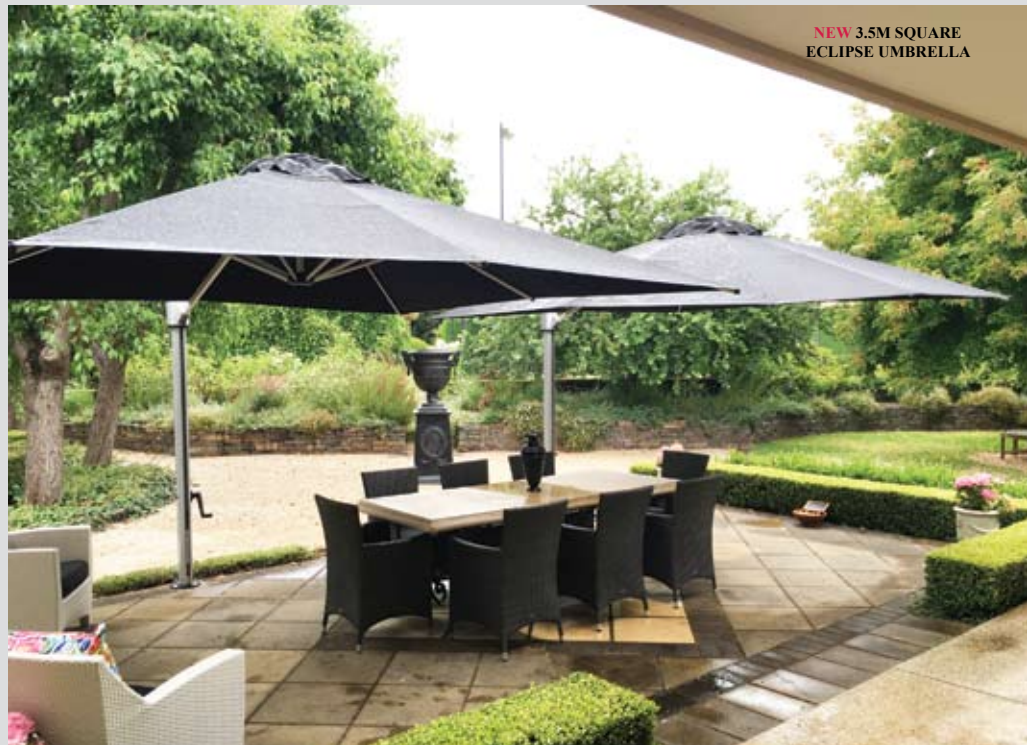
NEW 3.5M SQUARE ECLIPSE UMBRELLA

We were proud to be chosen for this recent Eclipse Umbrella supply and installation at MANDALAY HOUSE & GARDEN, an Exclusive Wedding and Event Venue. www.mandalayhouseandgarden.com