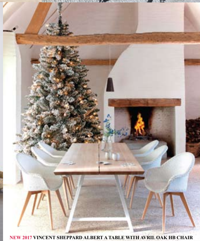
NEW 2017 VINCENT SHEPPARD ALBERT A TABLE WITH AVRIL OAK HB CHAIR