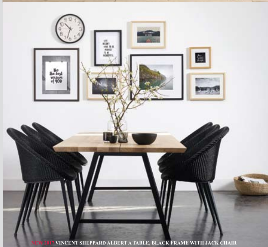
NEW 2017 VINCENT SHEPPARD ALBERT A TABLE, BLACK FRAME WITH JACK CHAIR