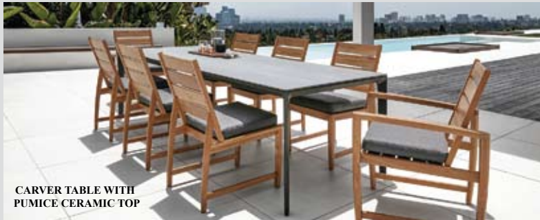
CARVER TABLE WITH PUMICE CERAMIC TOP